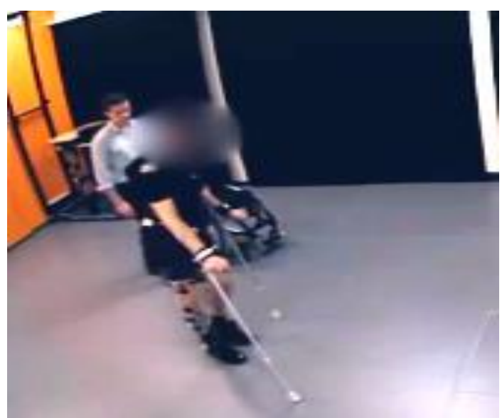
Figure 11: An person with an partial spinal cord paresis is walking with two elbow crutches. This support is necessary to control his balance and weight and make the variation in walking very poor. The power of the arms are now complete necessary to fill the gaps that are created through the spinal cord problem and now with the complete gravity on his body is walking pattern poor and balance is determinate through his crutches. Walking exercises on this way is an task specific resistance treatment for the arms and the upper trunk, or the legs have an benefit is an great question.