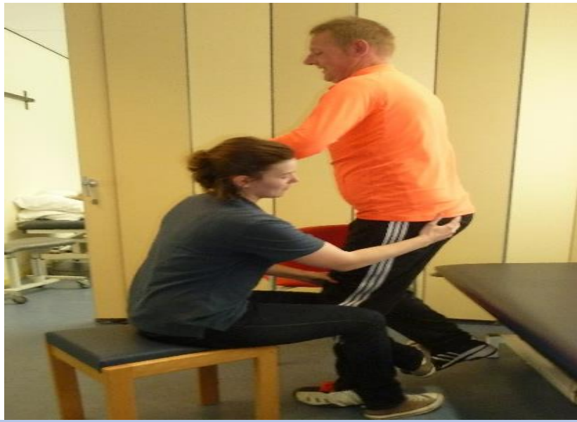
Figure 5: The assessment of 1 R.M. of hip extension of the left leg of this gentleman after an stroke about 1 year ago. His problem was that he wasn't capable to walk through and place his not-affected foot for his affected foot and that his speed was too slow.

First the coordination will increase after that the power and this must lead to an better walking pattern with more step length and speed.