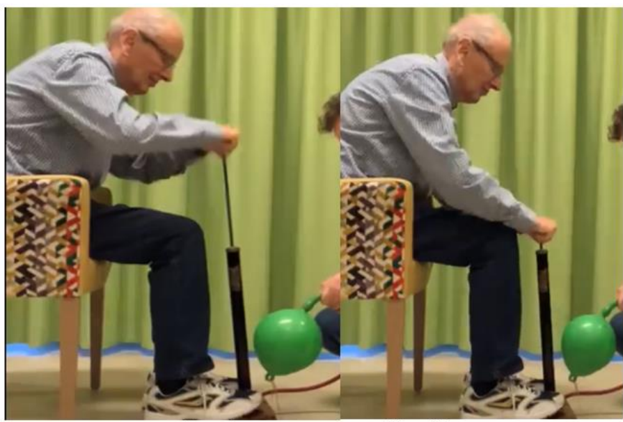
Figure 9 Figure 10