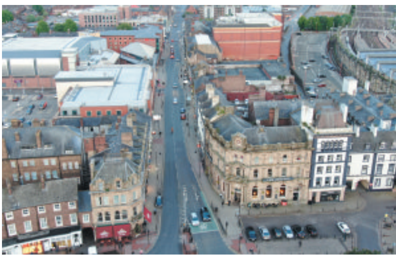
The city of Carlisle

anticipated through the Shared Prosperity Fund. Reorganisation of local government therefore coincides with significant demands on local authorities to prepare plans for economies and deliver projects that could, at the very least, have significant impacts on the quality of public realm in high streets and town centres.