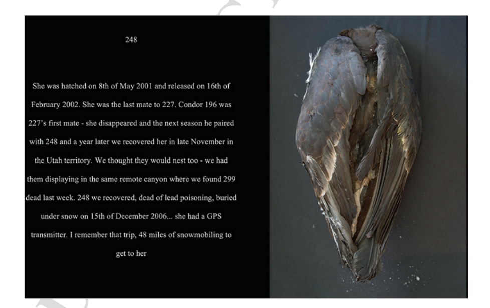
Fig. 5 Snæbjörnsdóttir and Wilson. Condor #248, still from single channel video work You Must Carry Me Now, 2014. (Collection ASU Museum and Art Gallery, Tempe, Phoenix; © Snæbjörnsdóttir and Wilson)

In You Must Carry Me Now, both a photographic and a video work including images of 14 frozen condor bodies, carefully laid out on black cloth, the photographs are juxtaposed with written texts that describe aspects of their individual lives and behaviours as revisited in the recollections of their human stewards (Fig. 5). When alive, these condors had been part of a conservation project in and around the Grand Canyon, Arizona. Initially, back in 1987, all 22 remaining condors had been removed from the wild as part of a capture-and-release programme in order