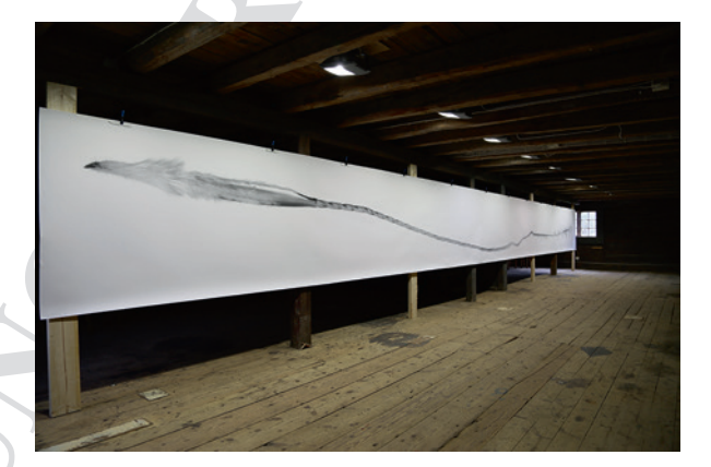
Fig. 6 Snæbjörnsdóttir and Wilson. Searching for Stipa, archival photograph (dimensions 1.5 \times 14 m), from the project Beyond Plant Blindness, 2017. (Installation in Stolpboden building, Botaniska, Gothenburg, Sweden; © Snæbjörnsdóttir and Wilson)

In our most recently completed project, Beyond Plant Blindness (2017), possibly our most challenging to date, this collaborative project has seen us functioning as artists within a research context involving botanists and plant 'collecting' (Fig. 6).