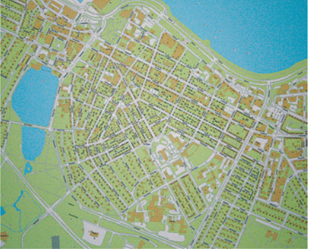
Fig. 2 Snæbjörnsdóttir and Wilson. (a) fly, shooter and shot map (photograph, 85 \times 100 cm and map, 70 × 90 cm), 2006. (National Museum of Iceland, Reykjavík; © Snæbjörnsdóttir and Wilson)