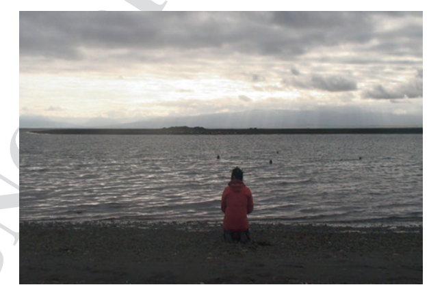
Fig. 3 Snæbjörnsdóttir and Wilson. Three Attempts , still from single channel video work, from the installation between you and me , 2009. (© Snæbjörnsdóttir and Wilson)

In our multi-media installation, between you and me (2009), one of the key components, Three Attempts is a performance-video work showing a live encounter between a human being and a colony of seals in an estuary on the north coast of Iceland (Fig. 3). Our intention for the piece was to engineer an encounter between seals and humans in a situation where having presented ourselves, it was then entirely the seals' choice as to whether the 'meeting' actually took place. Seals are thought of as curious animals and according to local folklore are attracted to the colour orange and this influenced the choice of the performer's outfit. A camera was set up behind the figure as she knelt down on the shore looking out to sea, emulating as much as possible the body contours of a seal. For a long time (as is playfully reflected in the title of this work Three Attempts ) nothing happened. The tide was coming in and in the film one can see the seals popping into the sea from the bank on the far side of the estuary; but still they kept their distance. The performer whistled various tunes but stayed mostly still—finally the seals started to come closer and to bob up in the sea in front of the performer—one after another. When this work was shown in association with the Minding Animals #1 Conference in Newcastle, Australia (2009) there were some who supposed we had tapped into some kind of 'magic' or shamanistic method to call the seals out of the