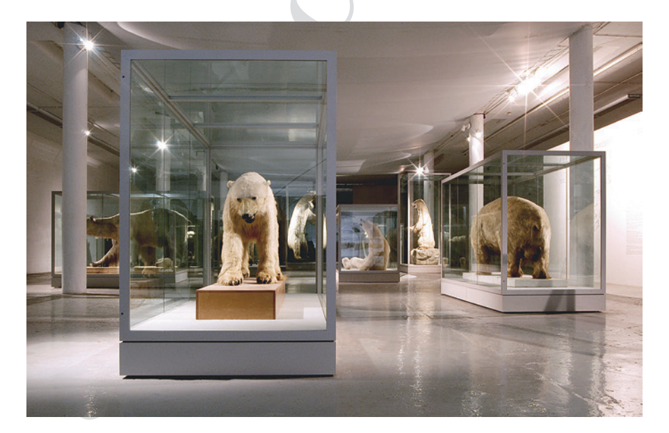
Fig. 1 Snæbjörnsdóttir and Wilson. nanoq: flat out and bluesome , installation incorporating ten taxidermic polar bears, 2004. (Spike Island, Bristol, UK; © Snæbjörnsdóttir and Wilson)

She was part of a group of Glasgow-based artists making an exhibition (1999–2000) for the Centre for Contemporary Arts in the City. Characteristically she had