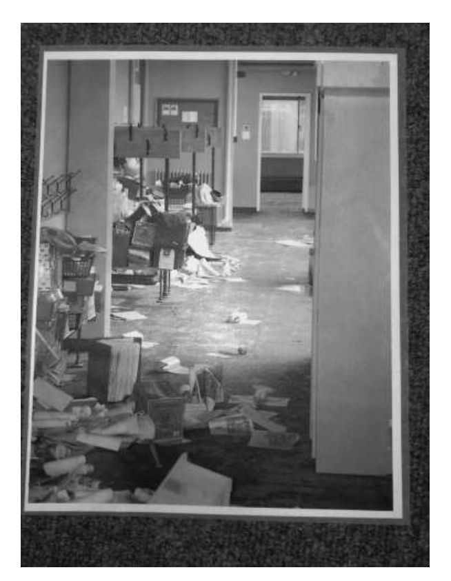
Figure 4 Damage (from Primary School notice board).

tempers. Parents got very angry and irate about things that we had no control over, like when buses were late to collect the children or take the children back. There would be an explosion with a parent, over the top angry, but it was because of the stress they were all living under. It wasn't actually that event, it was just the last straw. Certainly in the first few months there were difficulties. There were also difficulties because the whole of the area was so badly hit it was "who do you go to for help?", "who's going to organise it all?", "where's the money going to come from?". We had more questions than answers in the first few months, but then as the work began and things settled down, then people calmed as well'.