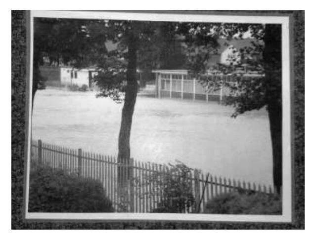
Figure 2 School under water (from Primary School notice board)

In trying to describe the first few days of the floods, respondents used terms such as 'surreal', 'crazy' and 'an absolute nightmare'. For example, FSE04 states that 'it seems unreal now. Even looking back you tend to forget how bad it actually was' (Figure 2 indicates the level of flooding at one of the study schools).