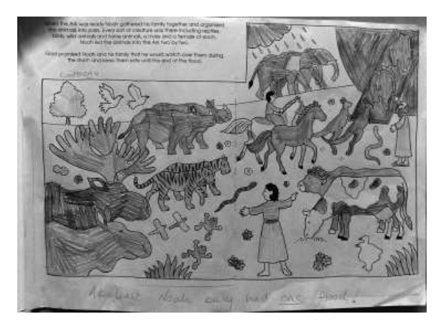
Figure 3 Using the flood in the curriculum (with wry comment from teacher).

While all schools incorporated flooding into the curriculum in some form, it is perhaps unsurprising that most head teachers (FSE02; FSE03; FSE05; FSE06) mentioned 'circletime' as an important technique for discussing flood-related trauma and anxiety For example, FSE06 stated that 'we talked about the floods quite a lot in our circle-time, we put a lot of time into creating a good environment for the children, giving them an opportunity to discuss anything bothering them. We tried to get some of the children who were flooded to talk to the other kids about their experiences, so they could understand the situation, and they'd talk about losing stuff, toys or "my play station had to be chucked out" and the others would say wow or something. That sort of thing. Some of the teaching staff who were flooded also talked to the kids about their experience, which also helped. So we just talked about things, the children also wrote about the floods and created pictures' (Figure 3). In this way pupils' experiences of the floods were also