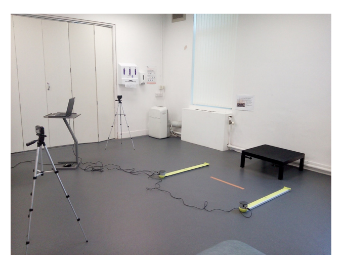
Figure 2. Equipment set-up