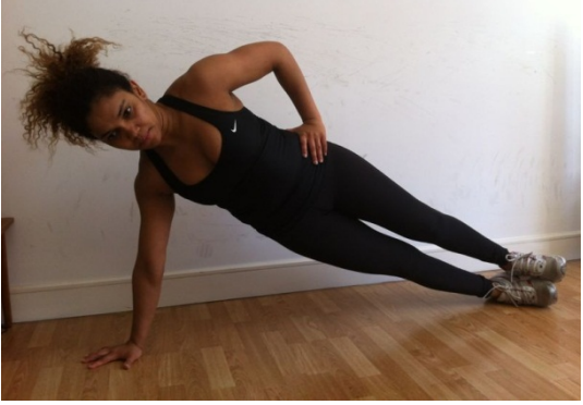
Side PlankOne Arm Side PlankWeek 1, 2 = 3 x 30 s hold (each side)Week 5, 6 = 3 x 45 s hold (each side)Week 3, 4 = 3 x 45 s hold (each side)