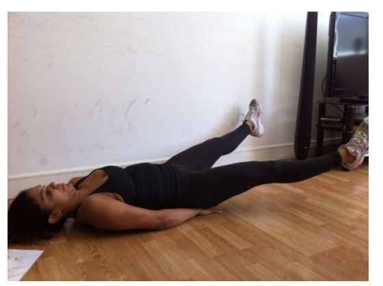
Spilt Legs Scissors Week 1, 2 = 3 x 20 reps