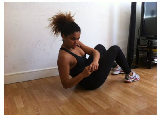
Russian Twister Week 1, 2 = 3 x 20 reps Week 3, 4 = 3 x 30 reps