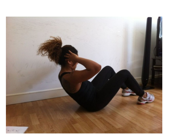
Abdominal Crunch Week 5, 6 = 3 x 45 reps